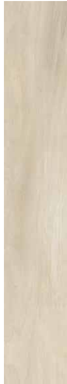
212660DRT ■ 27 Essenze Larice Rett. 19,9x119,8 / 7,8"x47.16"