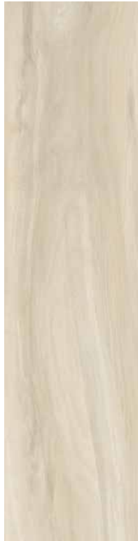
312660DRT ■ 27 Essenze Larice Rett. 29,8x119,8 / 11.73"x47.16"