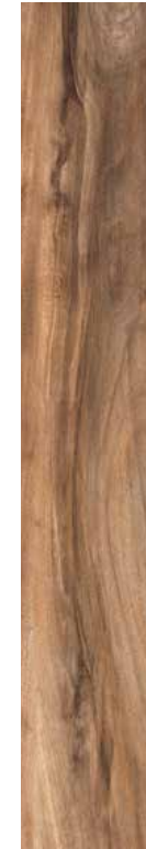
212660FRT ■ 27 Essenze Sequoia Rett. 19,9x119,8 / 7,8"x47.16"