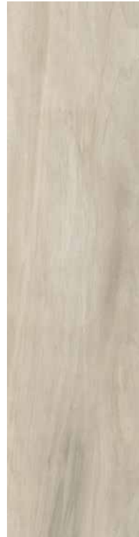
312660HRT ■ 27 Essenze Acacia Rett. 29,8x119,8 / 11.73"x47.16"