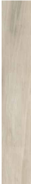
212660HRT ■ 27 Essenze Acacia Rett. 19,9x119,8 / 7,8"x47.16"