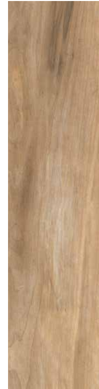
312660BRT ■ 27 Essenze Tanganika Rett. 29,8x119,8 / 11.73"x47.16"