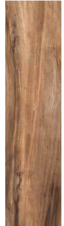
312660FRT ■ 27 Essenze Sequoia Rett. 29,8x119,8 / 11.73"x47.16"