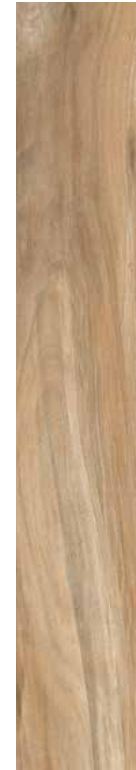
212660BRT ■ 27 Essenze Tanganika Rett. 19,9x119,8 / 7,8"x47.16"